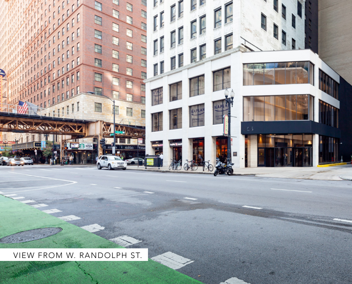
VIEW FROM W. RANDOLPH ST.