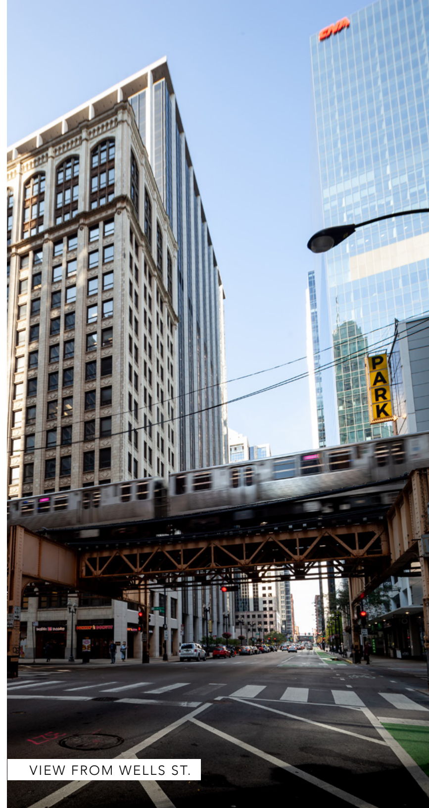
VIEW FROM WELLS ST.