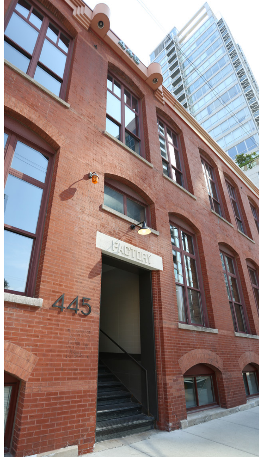
VIEW FROM WEST ERIE ST.