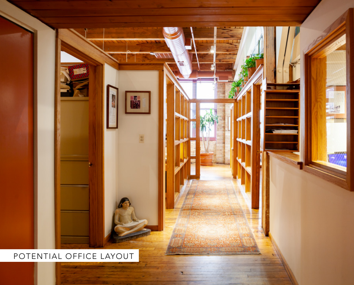
POTENTIAL OFFICE LAYOUT