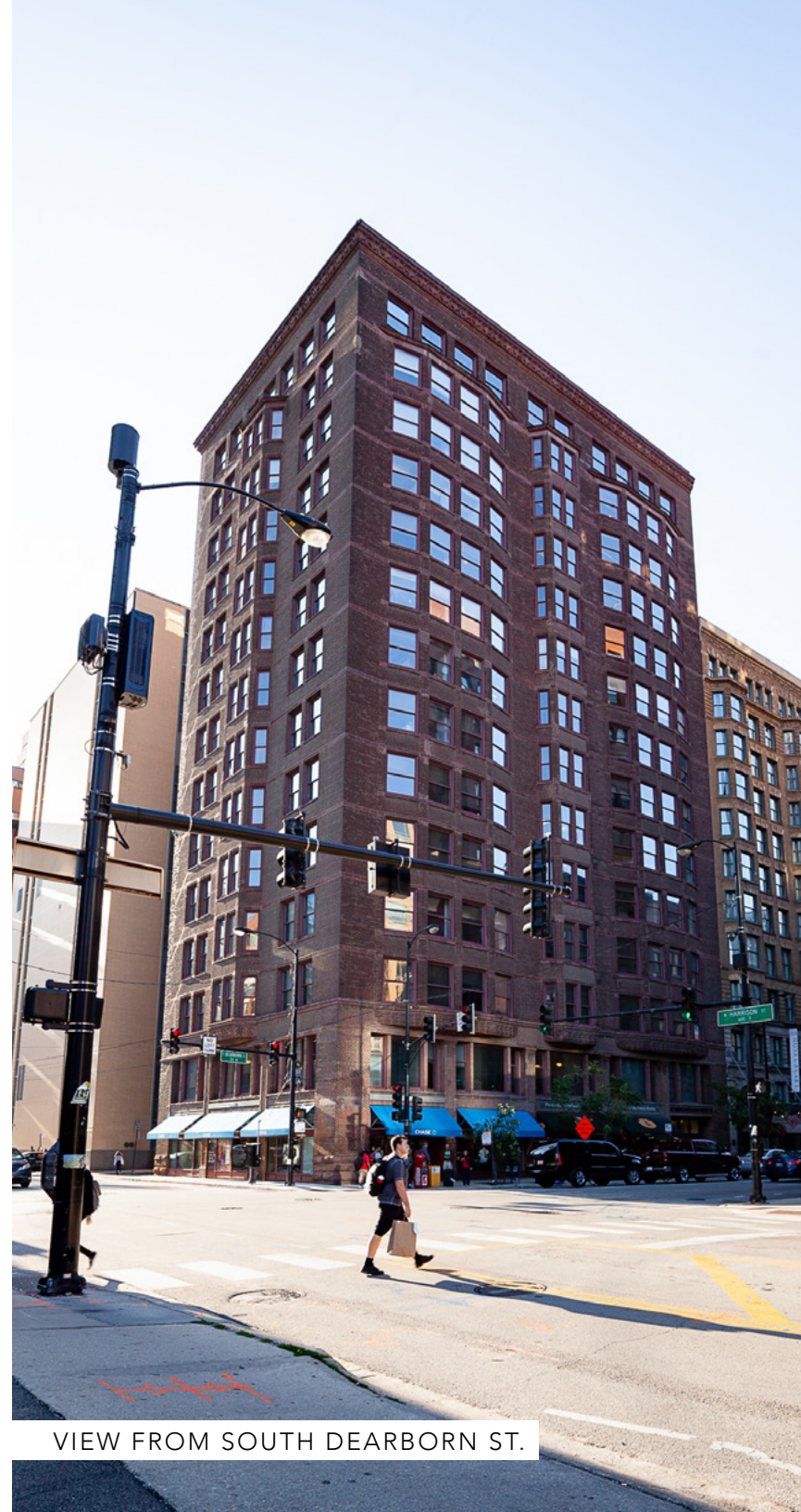
VIEW FROM SOUTH DEARBORN ST.