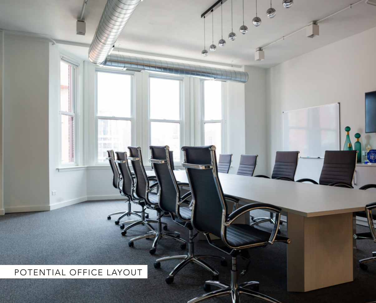
POTENTIAL OFFICE LAYOUT