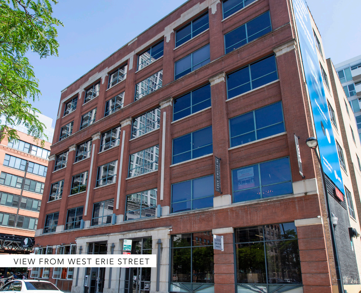
VIEW FROM WEST ERIE STREET