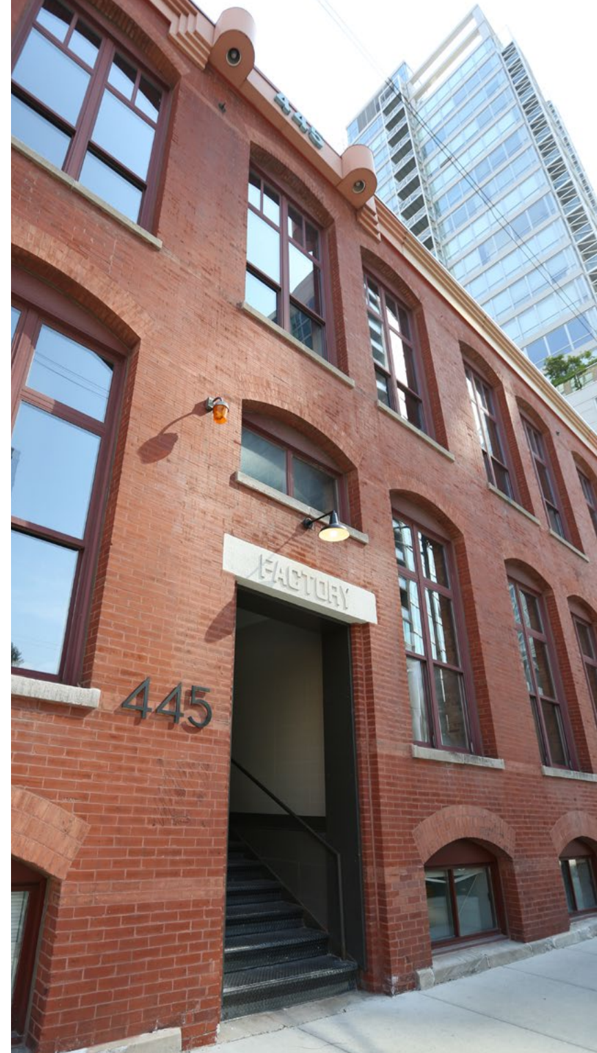
VIEW FROM WEST ERIE ST.